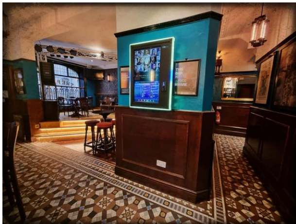
bar stage seating standing area.

https://www.facebook.com/ThePubLancaster/